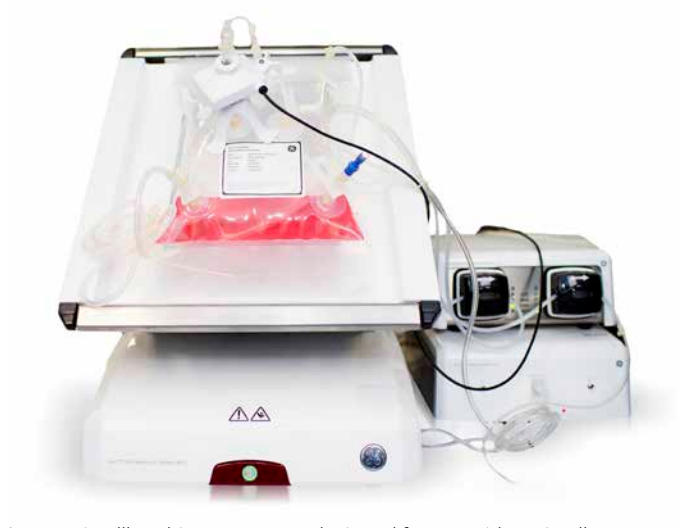
Fig 1. Xuri Cellbag bioreactors are designed for use with Xuri Cell Expansion Systems.

Xuri Cellbag bioreactors are supplied with a detailed validation guide providing you with all the relevant information you need to support regulatory compliance.