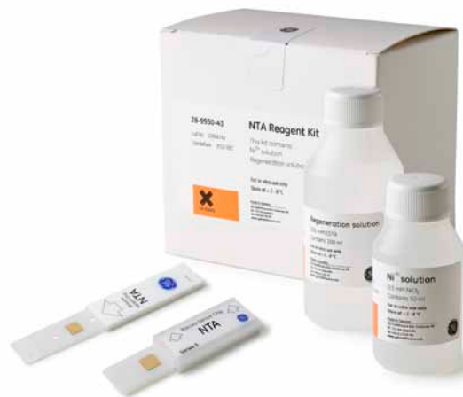
Fig 1. Sensor Chip NTA, Series S Sensor Chip NTA, and NTA Reagent Kit for capture of histidine-tagged molecules.

Attachment by capture has several advantages over covalent immobilization. Tagged proteins can be captured from crude media solutions, requiring little or no sample preparation. In addition, regeneration conditions are generic and therefore the need for assay development is minimized. Histidine tags are widely used since they are small and rarely interfere with the function, activity, or structure of target proteins. Two approaches for capture of histidine-tagged molecules are frequently used: Capture by an anti-histidine antibody; and capture on nickel-chelated NTA groups. GE Healthcare offers products for both approaches, Sensor Chip NTA with NTA Reagent Kit, and His Capture Kit (see Data file 29-0079-30). The choice between these alternatives often depends on the application. Sensor