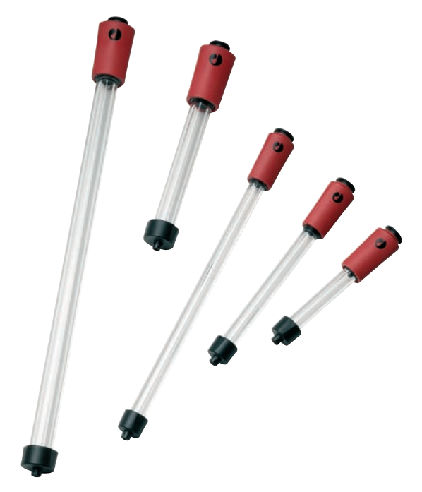
Fig. 1 Tricorn empty high performance columns.

A moveable adaptor simplifies adjustment of the bed height and maintenance, and a locking ring protects the medium bed from compression by accidental turning of the adaptor.