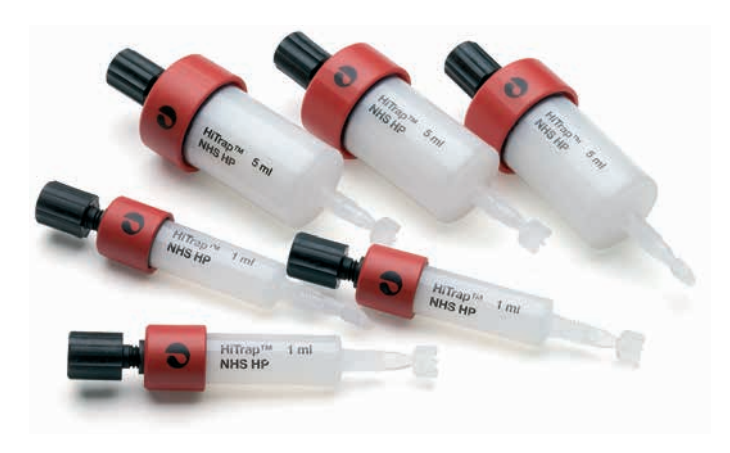
Fig 1. Prepacked with NHS-activated Sepharose High Performance, HiTrap NHS-activated HP columns allow for easy ligand coupling, allowing a wide range of uses.

Sepharose High Performance is the base matrix for HiTrap NHS-activated HP. The carbohydrate nature of the agarose base provides a hydrophilic and chemically favorable environment for coupling, while the highly cross-linked structure of the 34-µm spherical matrix ensures excellent chromatographic properties. Fast kinetics and high dynamic capacities are properties of all HiTrap affinity columns.