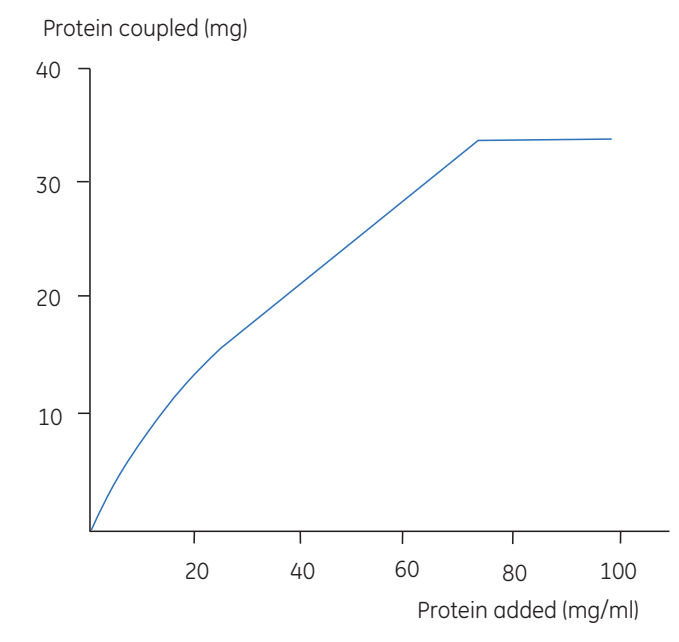
Fig 2. Coupling 30 mg of IgG to HiTrap NHS-activated HP 1 ml.

Figure 2 shows that over 30 mg of IgG can be coupled to a HiTrap NHS-activated HP 1 ml column. The procedure takes less than 15 minutes. Further studies have shown that ligands can be coupled in the presence of detergents such as 0.1% SDS, Triton X-100, Tween 20, and sodium deoxycholate, and that the yield is independent of pH in the range of 7–10.