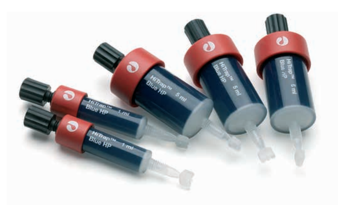
Fig 1. Prepacked with Blue Sepharose High Performance, HiTrap Blue HP columns offer fast and simple affinity purifications of proteins such as albumin, interferon, a broad range of nucleotide requiring enzymes, \alpha_2 -macroglobulin, coagulation factors, and nucleic acid binding proteins.

The dye ligand, Cibacron Blue F3G-A, is covalently attached to the Sepharose High Performance matrix via the triazine part of the dye molecule. It belongs to a special class of groupspecific ligands of considerable utility. Cibacron Blue F3G-A